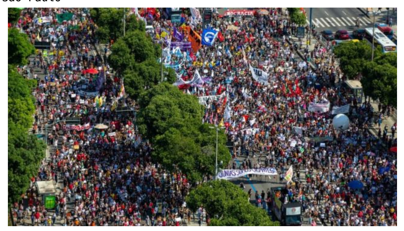
Rio de Janeiro